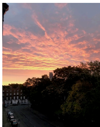
Sunrise in Myddelton Square

If you have any news items for circulation or inclusion in the next Square Roots please forward details by email to paulinemsa@aol.com .